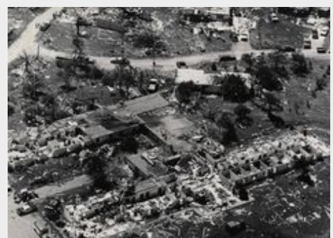
This is an aerial view of the Drumright Nursing Home, destroyed by the June 1974 tornado.