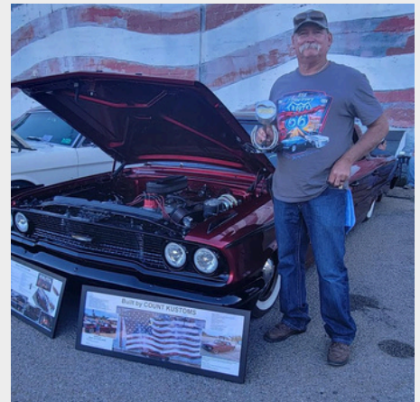
Best Classic Jesse James